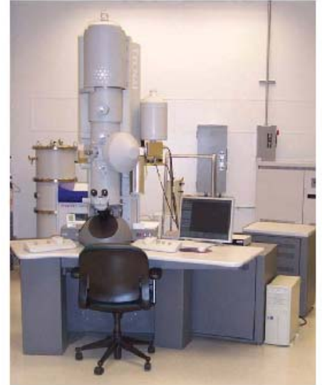
Tecnai F20 Transmission Electron Microscope

an atomic force microscope, metrology and wet chemistry cleanrooms, focused ion beam, furnace and plasma tools, and thin film deposition equipment, Hitachi S-800 and SU70 scanning electron microscopes and a Tecnai F20 transmission electron microscope impressed