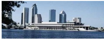
Florida West Coast Section, Tampa

IEEE, Inc- FWCS, 3133 W. Paris St. Tampa, FL 33614-5964