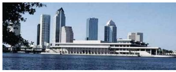
Florida West Coast Section, Tampa

IEEE, Inc- FWCS, 3133 W. Paris, Tampa, FL 33614