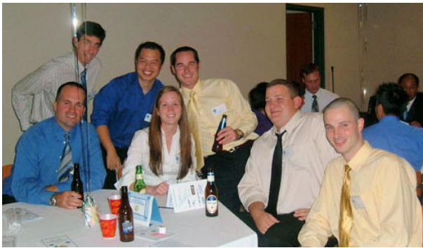
Some of the graduating senior EE's