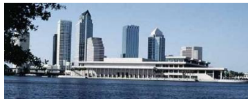
Florida West Coast Section, Tampa

Institute of Electrical and Electronics Engineers, Inc. Florida West Coast Section 3133 W. Paris Tampa, Florida 33614