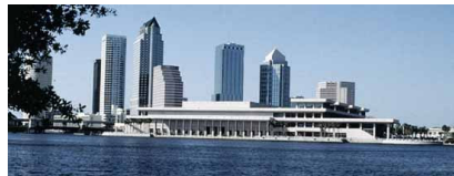
Sections Congress 2005 is coming to Tampa!

Institute of Electrical and Electronics Engineers, Inc. Florida West Coast Section 3133 W. Paris Tampa, Florida 33614